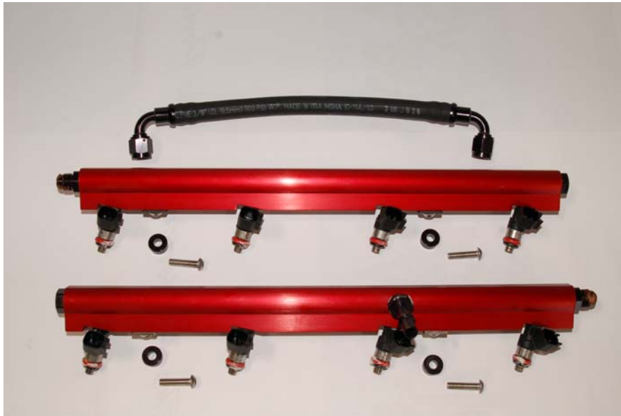
Kit assembled with injectors.