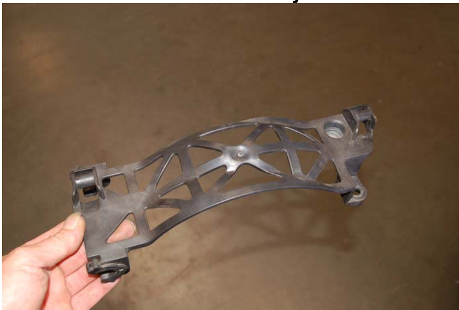
Fig 1. Engine cover bracket not reused.