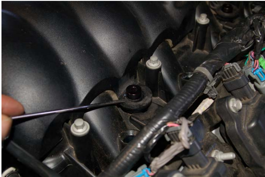
Fig 4. Spacer installed at rail mounting hole.