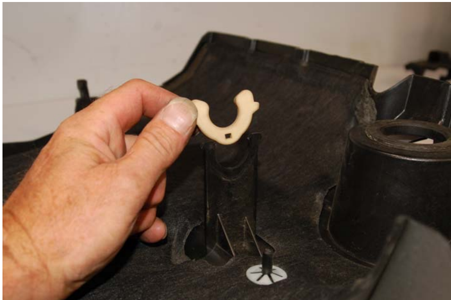
Fig 5. Clip removed so engine cover can be reinstalled with BBK fuel rail kit.