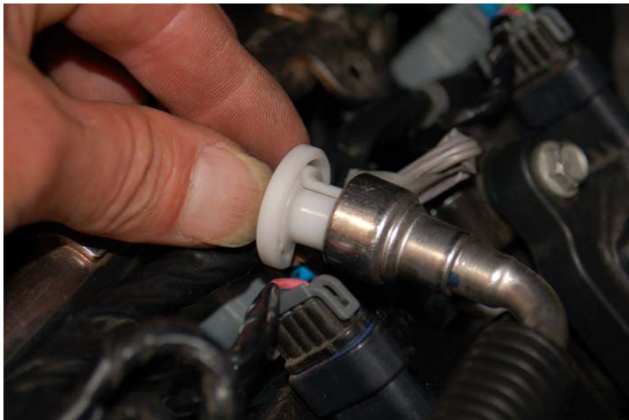
Fig 2. Springlock release tool.